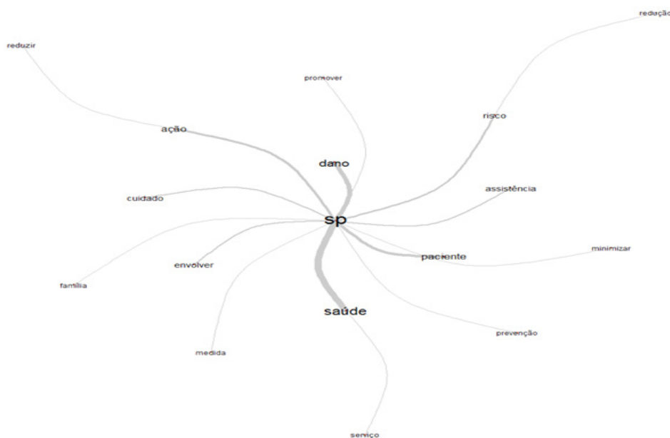
Figure 2 - Similitude analysis of the concepts of nursing professors regarding patient safety

The understanding of nursing professors regarding the meaning of PS were processed through a similitude analysis, which showed that the participants understand PS as conducive to the promotion of patient health, also believing that it is necessary to take action to prevent harm to these individuals (Figure 2).