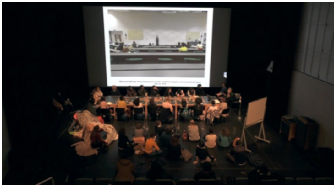
FIGURE 15 – Gomes, S. (2019) Table Upside Down Practices. Multi Use Room, Museum of Modern Art Calouste Gulbenkian Foundation [Photograph]

This is a preference for oralization over reading a written paper and in detriment to a performance with a univocal attendance to a singular presence. Moreover, instead of proposing a practice separated from non-methodical processes and contaminations the choice follows dance's inherently messy intricate dimension. Here, the interest is more in what choreographic performance does, what it performs in performing. It is an invitation to a performative choreographic encounter where the focus is on “what it does and how it does what it does” (SANTOS, 2018, p. 189). The conversational table does this by focusing on doing the work itself, performing it during the encounter. In other terms, at the table the emphasis is on how such knowledges are put to work during the encounter.