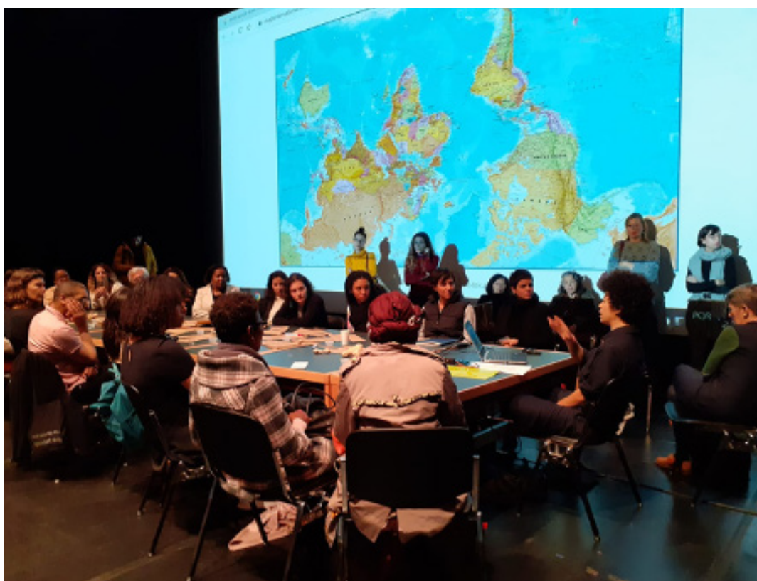
FIGURE 9 – Gomes, S. (2019) Table for Upside Down Practices. Multi Use Room, Museum of Modern Art Calouste Gulbenkian Foundation [Photograph]

Moreover, by giving the choice to establish the mode, direction of the performance or even a complete diversion of paths through a game with written cardboard pieces a significant decisive relevance is given to the visitors.