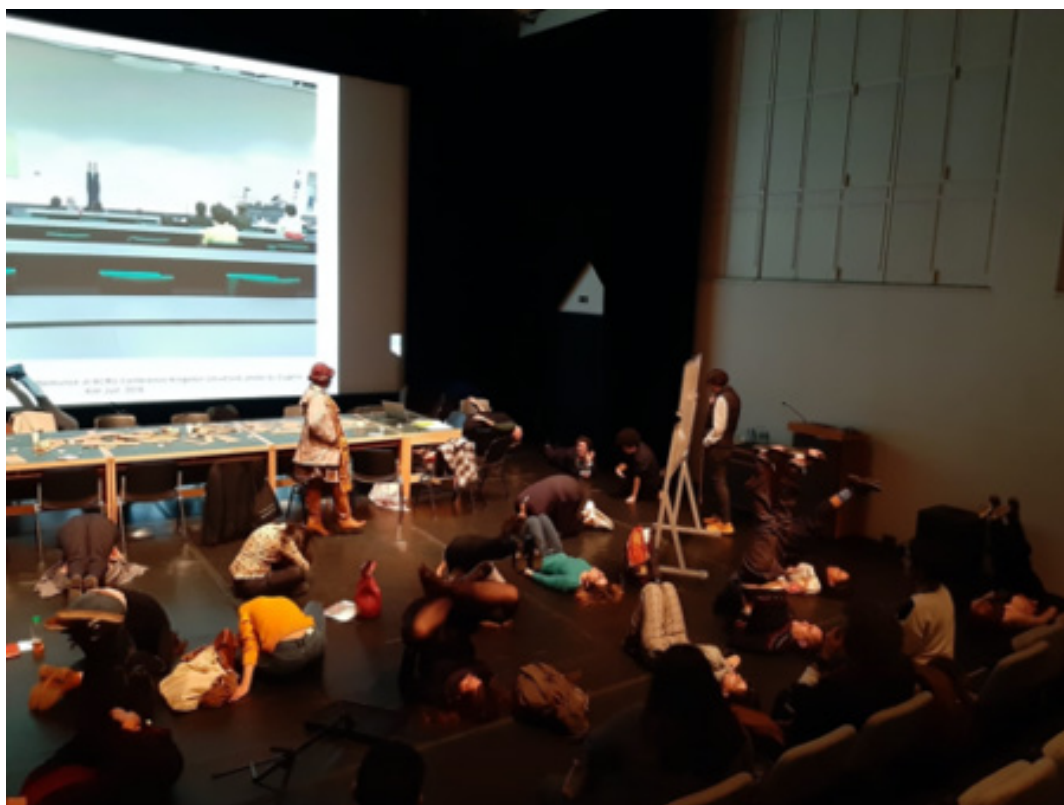
FIGURE 12 – Gomes, S. (2019) Table for Upside Down Practices. Multi Use Room, Museum of Modern Art Calouste Gulbenkian Foundation [Photograph]

The various cues in the form of body propositions, cards, things upside down in the room and rhizomes play an important role in opening space for other ways of knowing. They prioritize sampling, assemblage, embodied positionings and impressions verbally expressed or propelled by the degustation of an aromatic rhizome as privileged modes for knowing.