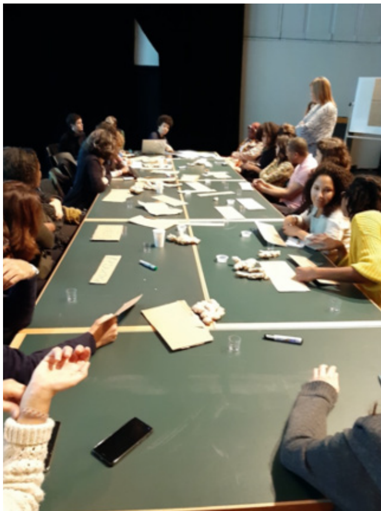
FIGURE 10 – Gomes, S (2019) Table for Upside Down Practices. Multi Use Room, Museum of Modern Art Calouste Gulbenkian Foundation [Photograph]

As mentioned before, the direction taken by the conversation is mediated through the cards. It is not the initial host who chooses what is spoken – this results from the participants' aleatory choices. Sampling emerges as a prominent practice exercised through the cards but also through a 'detox rhizome' (ginger) inside several tiny containers, and through conversations, interruptions, silences or other various choices at the disposal of the participants. Of particular importance is the fact that the meaning of some of the words on the cards is itself unknown to the original host, while some of the participants might hold that knowledge. In displaying an unfamiliarity and incapacity to speak Cape Vert Creole I am not only frustrating the presumptions of particular promised performances but also gesturing towards the opaque. I, we, together continue following the initial darkly lit path, the ginger subterranean root on the table raw or peeled in containers exhaling the fragrance of its stimulating properties. Hereof, the intention is to excavate at the margins "making and