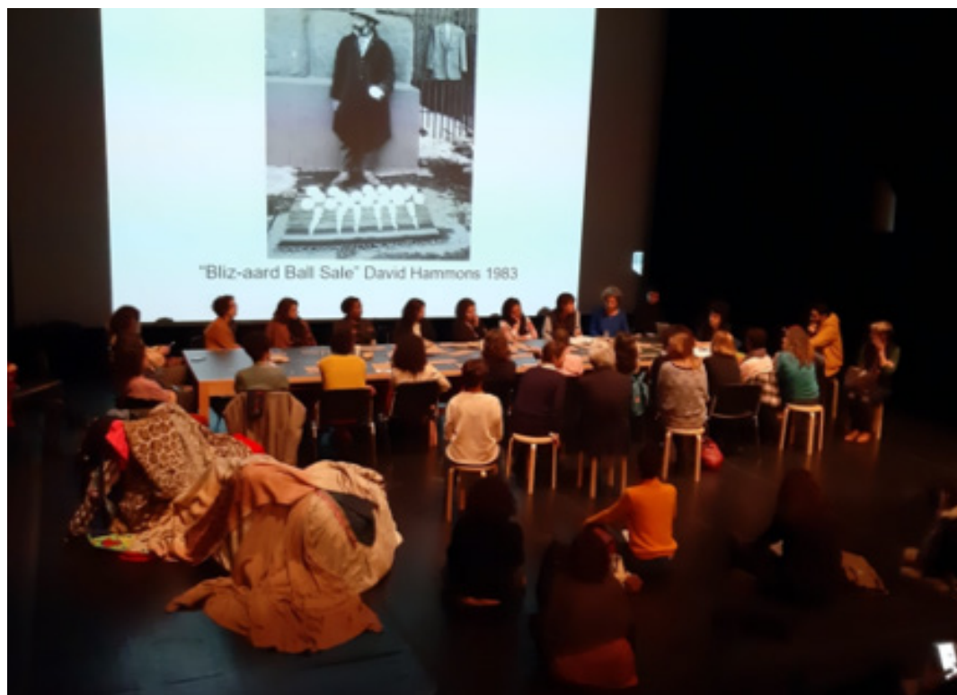
FIGURE 14 – Gomes, S. (2019) Table for Upside Down Practices. Multi Use Room, Museum of Modern Art Calouste Gulbenkian Foundation [Photograph]

The bringing to the table by the curator of the museum of a microphone at the end of the event (which was not part of my initial instructions of the table) is an interesting element rightly noted by some participants. It is only because such a device was not there during most of the conversations that it was noted. And yet it demonstrated that certain performativities are ingrained and that an awareness of them through hearing can be developed is of utmost importance.