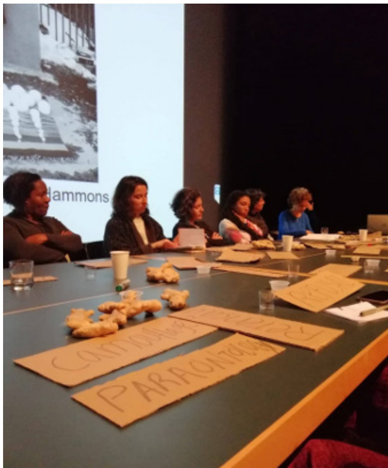
FIGURE 13 – Gomes, S. (2019) Table for Upside Down Practices. Multi Use Room, Museum of Modern Art Calouste Gulbenkian Foundation [Photograph]

Here, ginger root plays an important role at the table. It is placed on the table bare or peeled cut in small pieces ready to be tasted, releasing its aroma. It is a minor but an important detail. When unpeeled its colour is not dissimilar to the cardboard pieces lying on the table. Its fragrance is mainly due to gingerols which are one of its components.